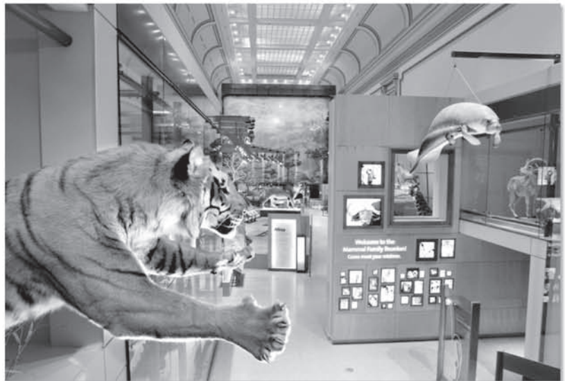
The dramatically posed animal specimens provided once-in-a-lifetime opportunities for taxidermy artists, who came from around the country to work on Mammals .

Developing an exhibition of this scope is never without its challenges and set-backs, and Mammals had its share of both. The original design firm contracted, Douglas-Gallagher, split into two separate firms one year into the project. During the period of readjustment that followed, the team took the exhibition concept plan onto the Smithsonian Mall. The full-size layout on the grass revealed that they had recreated the tight, cramped pathways they were trying to correct. Reich + Petch Design International, of Toronto, Canada, was brought