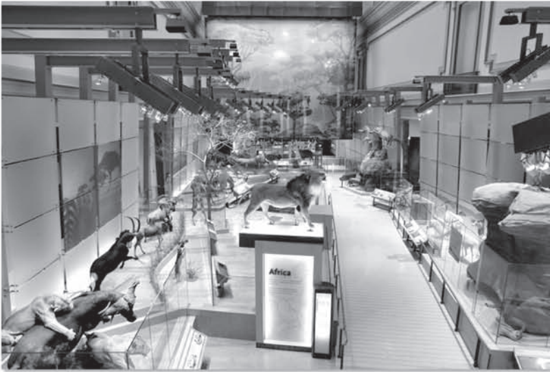
The bright open hall is welcoming and easy to navigate, in contrast to the labyrinthine halls of the past.