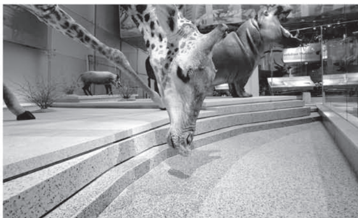
You don't need a realistic setting to tell you what this giraffe is doing.

Editors note: Three independent reviews of the same exhibition are presented here.