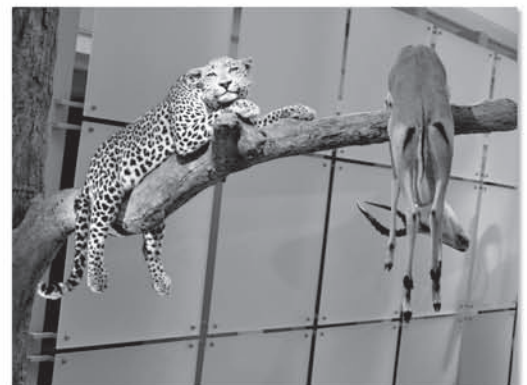
With minimal context the animals take center stage.

Because evolution and deep time are difficult concepts to convey in static exhibits, there is an entertaining and informative short film about