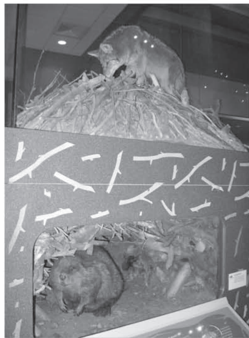
The lifelike poses of the animals inspire conversation among visitors.

The content of the exhibition is a natural draw for a family audience. Animals can be especially fascinating to children. The life-like poses of the animals in the exhibition help make them even more relatable. From the very entryway the exhibition hooks the attention of its visitors with the great variety of mammal specimens on display. I have visited Mammals several times and each time I am immediately attracted by the large cases on either side of the entryway, displaying a variety of mammal species. This seems to catch the attention of most visitors as they enter the exhibition, as well. The immediate reaction of families, on entering, is to exclaim "Look at all the animals!" Parents turn to their children and ask: "What animals