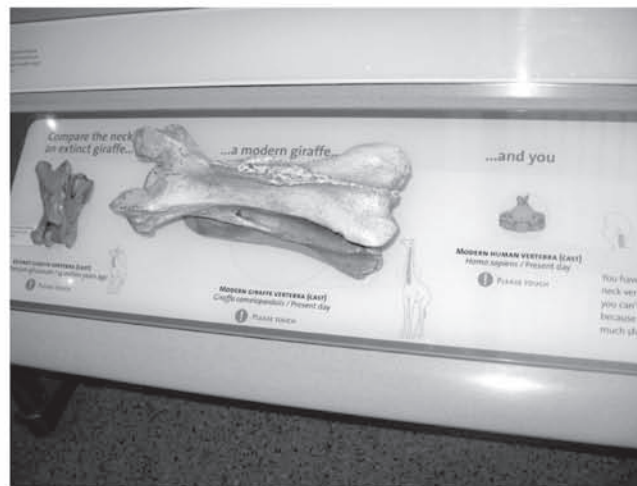
Interactive exhibit components, including this cast of a giraffe vertebra, provide multiple ways for visitors to engage with the content of the exhibition.

Mammals includes many exhibit elements that can appeal to a variety of different types of learners. There are many objects that can be touched and manipulated, such as the casts of a modern giraffe vertebra, extinct giraffe vertebra, and human vertebra.