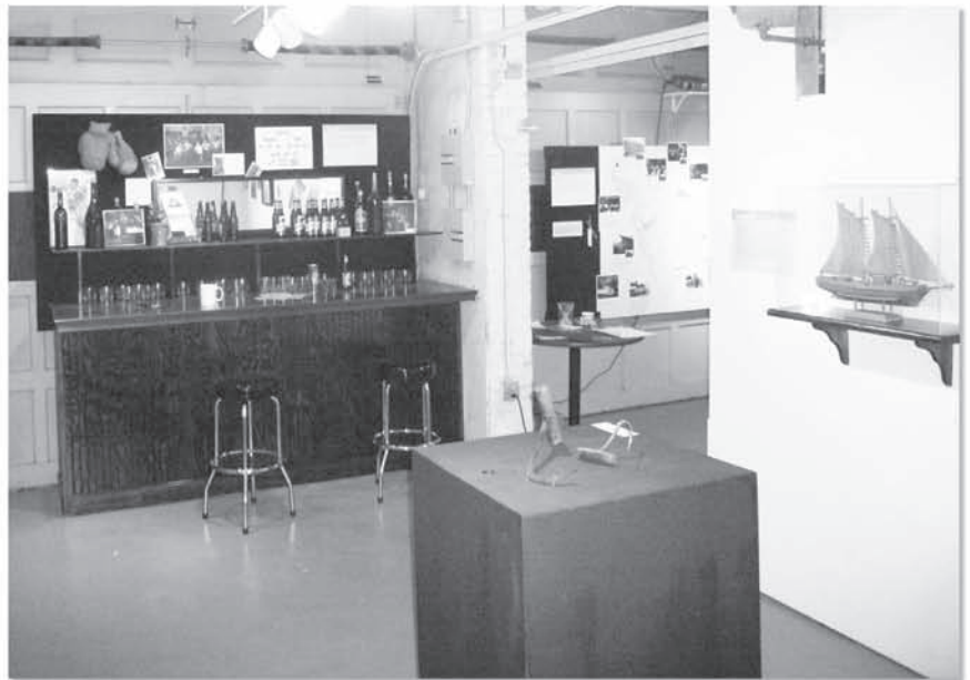
The Bar section, a reproduction based on images and including copies of historic newspaper articles and photographs, is tied to the Port section. To the right: the interactive map where visitors can tag locations in Fox Point with the stories.

What were some of their decisions? They decided on the categories of the exhibition first based on research, then on the space available, and changed them again based on further work with the designer. They chose important