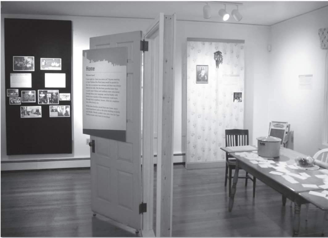
Part of the Home section. On the walls are objects found in many Fox Point homes; on the table reproduced recipes for visitors to take with them.