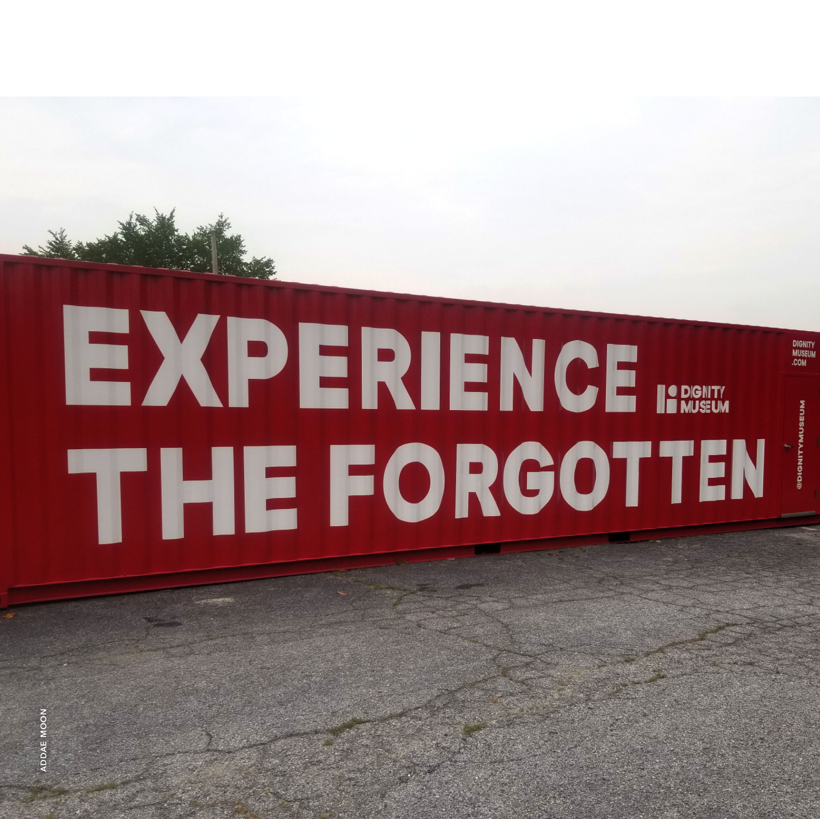
Fig. 1. The exterior of the movable shipping container which houses the Dignity Museum.