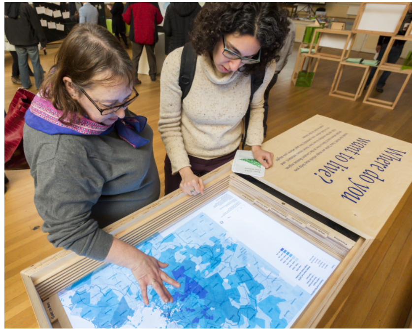
Fig. 1. The Boston-area Metropolitan Area Planning Council’s public engagement events feature hands-on interactives, such as this data map. Sliding transparent overlays add layers of data, including housing costs, walkability, flooding, and school growth.