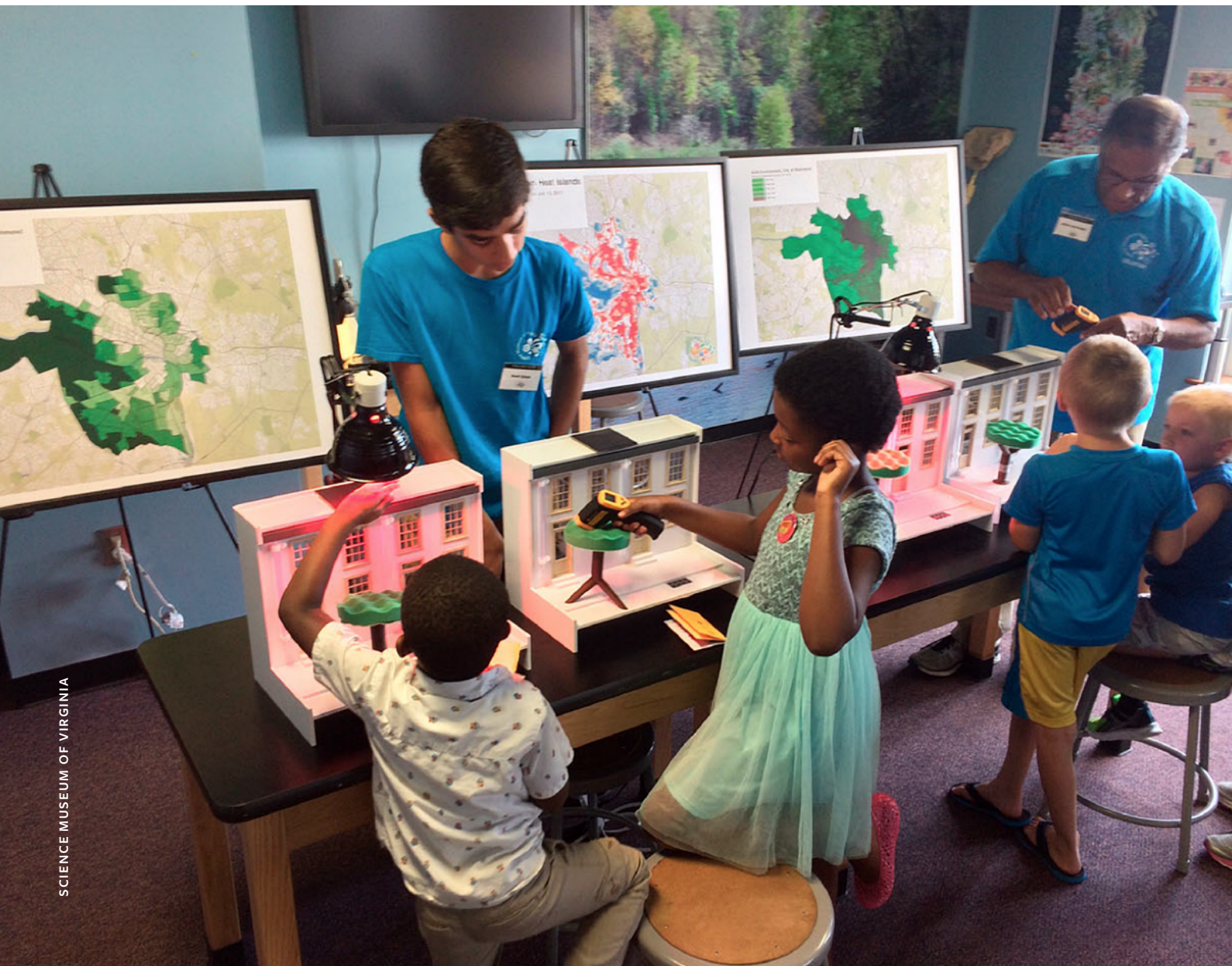
Fig. 5. In its “Ready Row Homes” program, the Science Museum of Virginia brings the phenomenon of urban heat islands to life with museum-generated surface temperature maps (behind facilitators) and with hands-on interactives. Using infrared thermometer guns, young learners test ways to keep model row houses cool under summer sun.