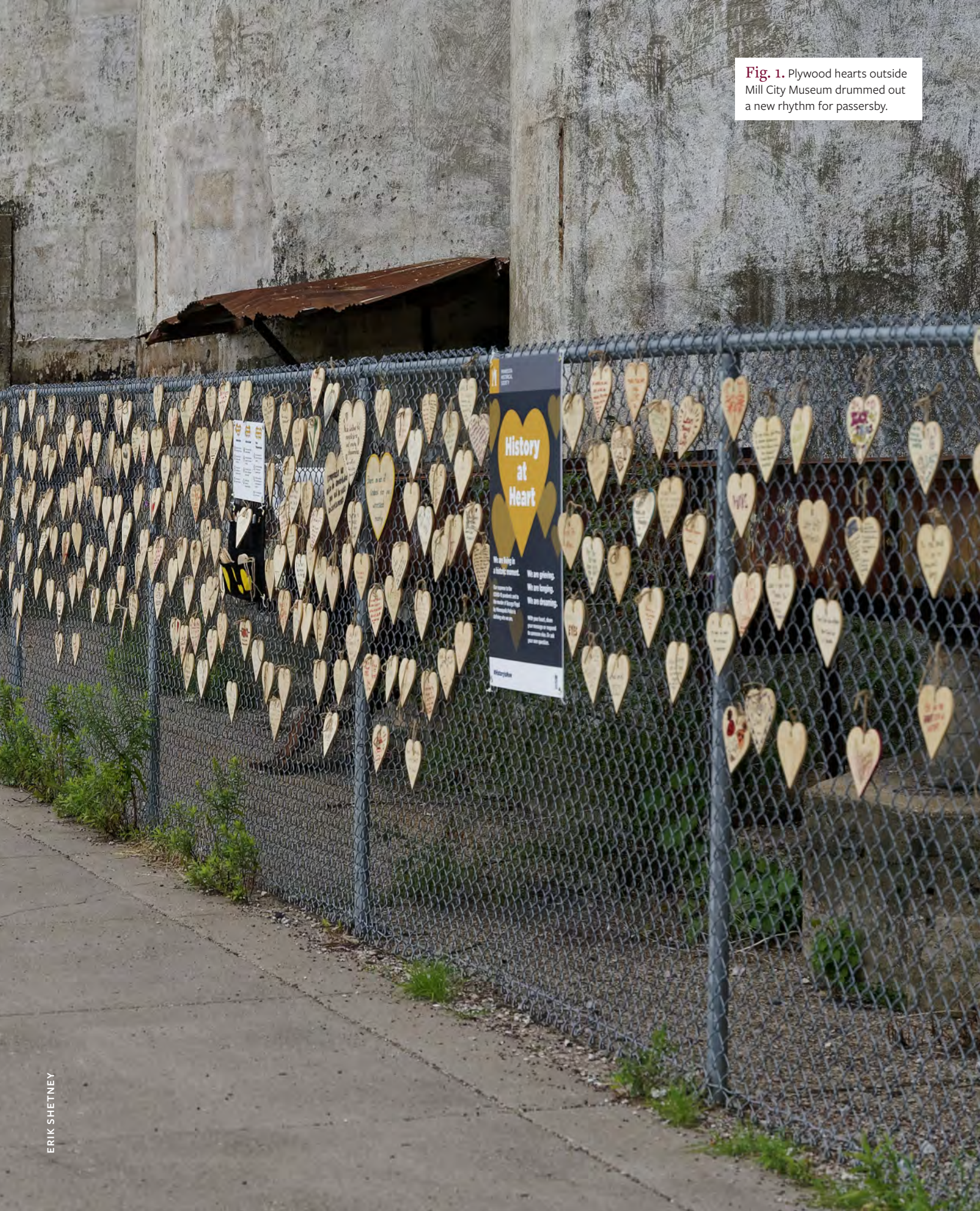
Fig. 1. Plywood hearts outside Mill City Museum drummed out a new rhythm for passersby.